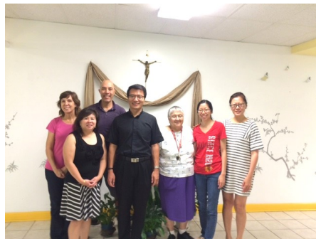
St. Therese Catechist gathered for a day of reflection on God's grace and their ministry (Aug. 27th).