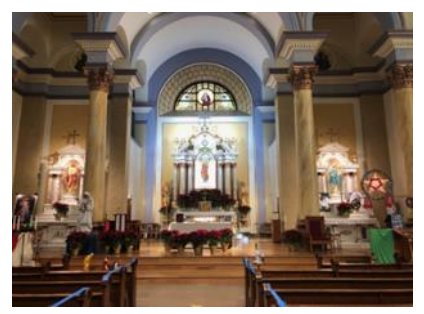
New Year "Resolution"

What's your New Year's resolution for your own life, your family, and your parish?